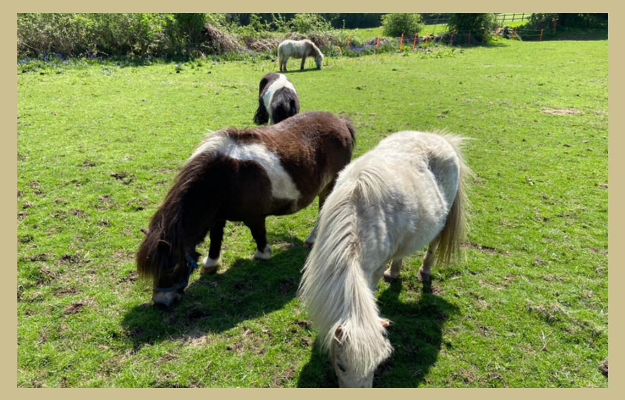
HERBIE, VICTOR, PEACHES AND HOLLY

We also have the Shetlands who are so cheeky and funny and keep us in fits of laughter, they are real survivors. For instance, Peaches and Victor were rescued from a back street yard in Cardiff in a state of complete neglect, starving and without water, they are now the picture of health, maybe a bit too healthy around the girth. But my Mother the founder of DHAPS always said she would rather see a well fed round horse than a thin one so we have always tended to make sure they have more than adequate food, sometimes the Shetlands look a little too well, so they are on a diet in the New Year. Sadly, they will be leaving us soon to go to their fabulous new home.